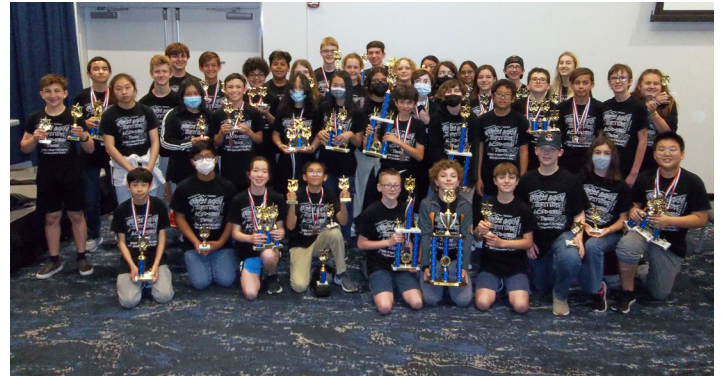
5A Sweepstakes: Flour Bluff.