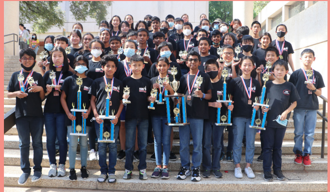
6A Sweepstakes: Fort Settlement Middle School