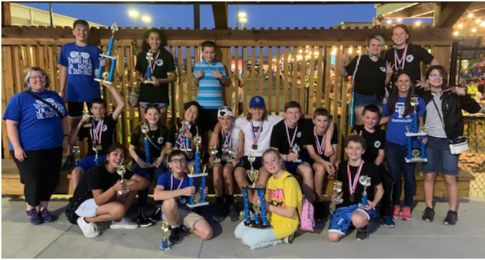
4A Sweepstakes: Spring Hill.