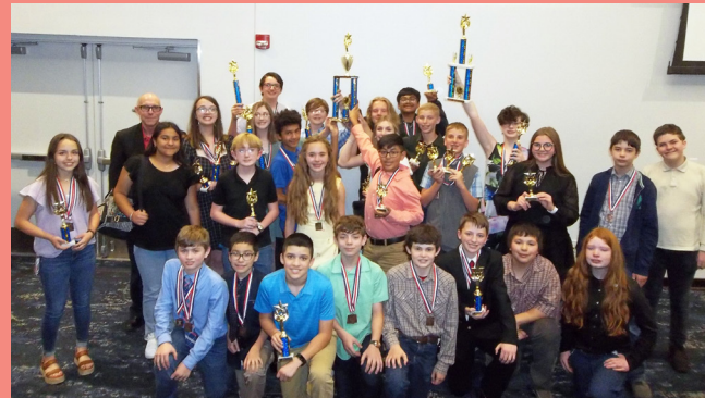
1A/2A Sweepstakes: Olney Junior High