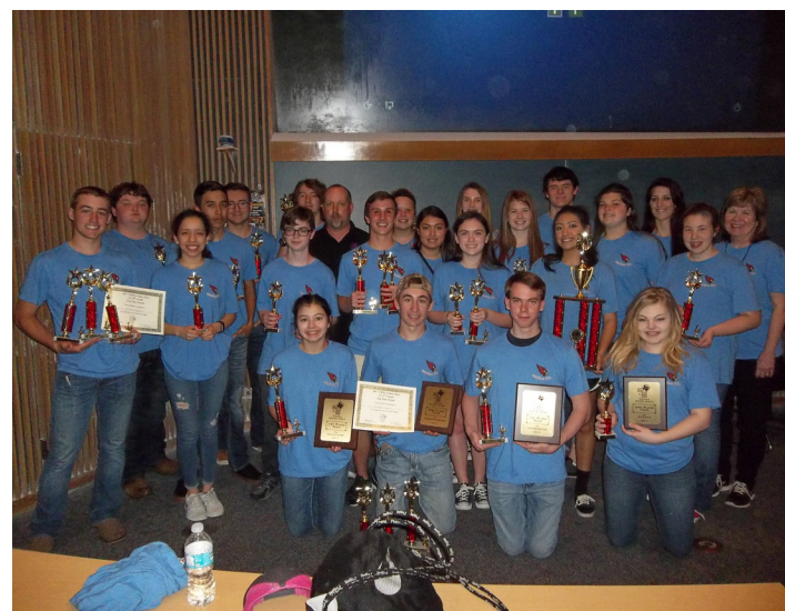
3A First Place Sweepstakes: Sabine High School.