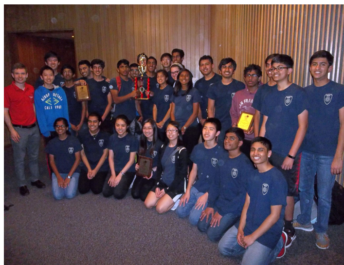
6A First Place Sweepstakes: Dulles High School.