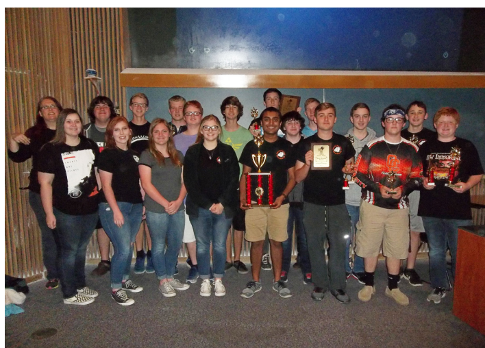
3A Second Place Sweepstakes: Queen City High School.