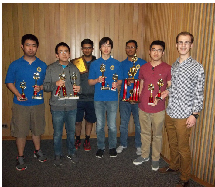
6A Second Place Sweepstakes: Klein High School.