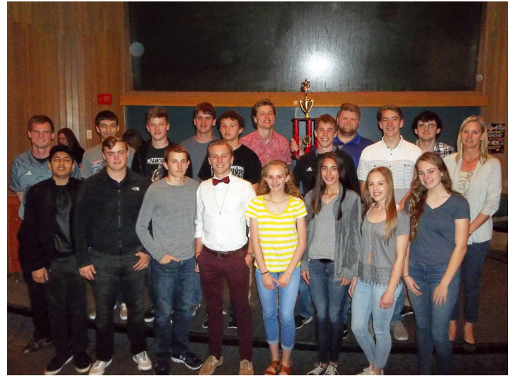
1A/2A First Place Sweepstakes: Lindsay High School.