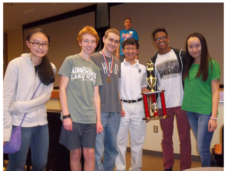
5A Second Place Sweepstakes: Lubbock High School.