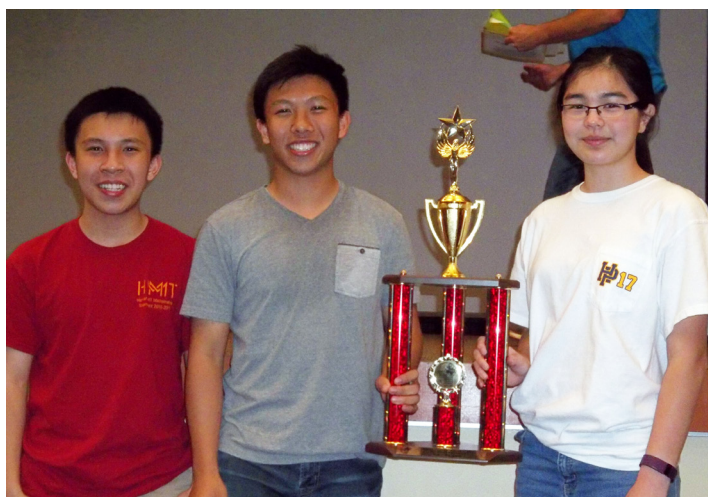
5A First Place Sweepstakes: Highland Park High School.