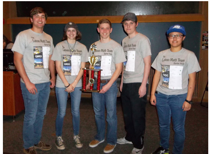
1A/2A Second Place Sweepstakes: Latexo High School.