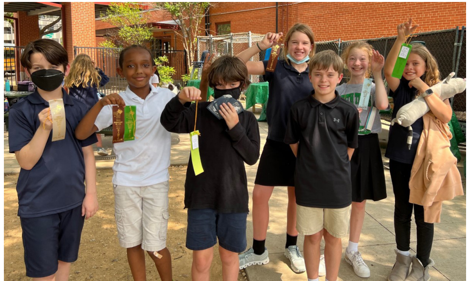
4th graders from Travis TAG elementary show off the ribbons they earned from the Elementary School Online State Meet.