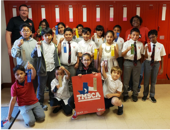
5A Elementary: Pine Tree (above).